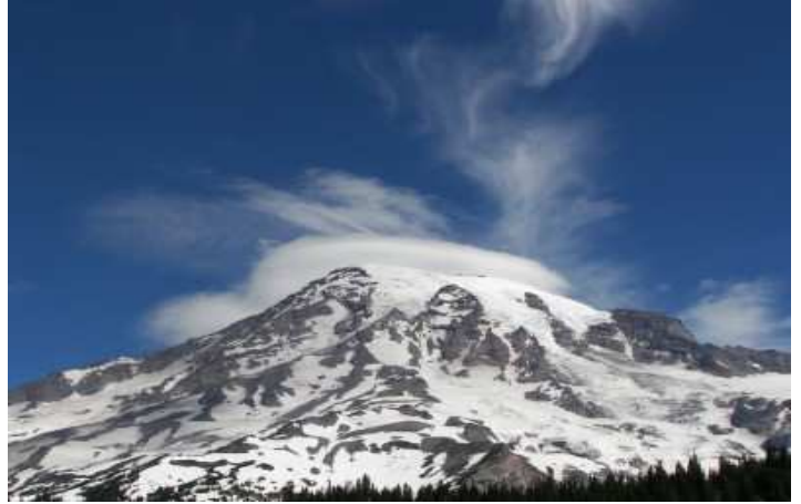
Mt. Rainier with cap cloud