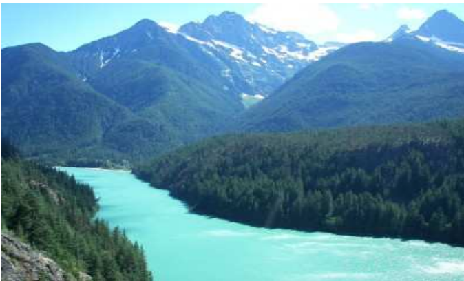
Diablo River Gorge – North Cascades