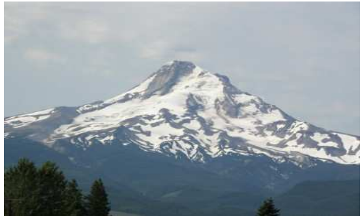
Mt. Hood - Oregon